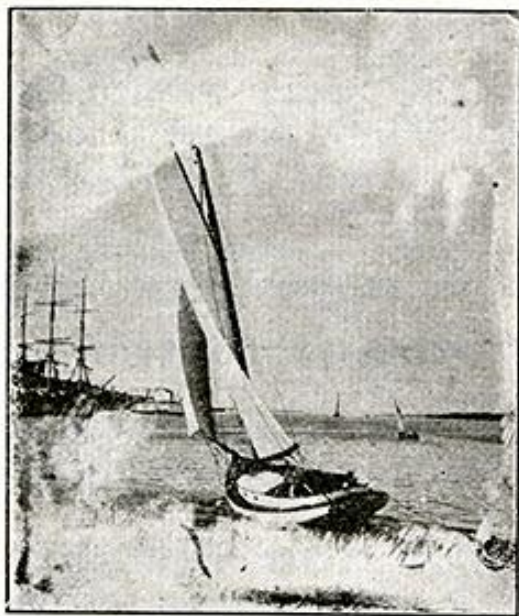
Developed in M. Q., half as strong as that advised in instruction sheet.