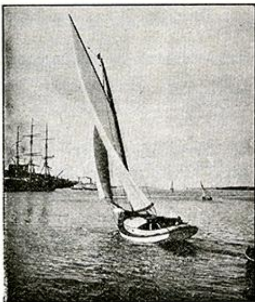
Developed in M. Q., strength as advised in instruction sheet.

Undoubtedly the paper absorbs moisture unevenly and in certain spots becomes repellent to the action of an incorrect de-